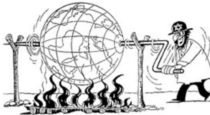
The waves of anti-Semitic cartoons in the Arabic media go on: from Al-Itihad (Dubai), titled: The End.

In conclusion the AHC expressed appreciation for the useful and concrete exchange which had taken place. He promised to revert to the specific matters that had been put to him