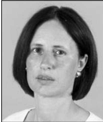
Opinion on any legal question".

The UN Charter, the international document which established the United Nations organization, numbers the International Court of Justice among the six organs making up the UN. The powers of the Court are anchored in the UN Charter and the Statute of the Court which are annexed to the Charter and form an inseparable part of it. These international documents reveal that the powers