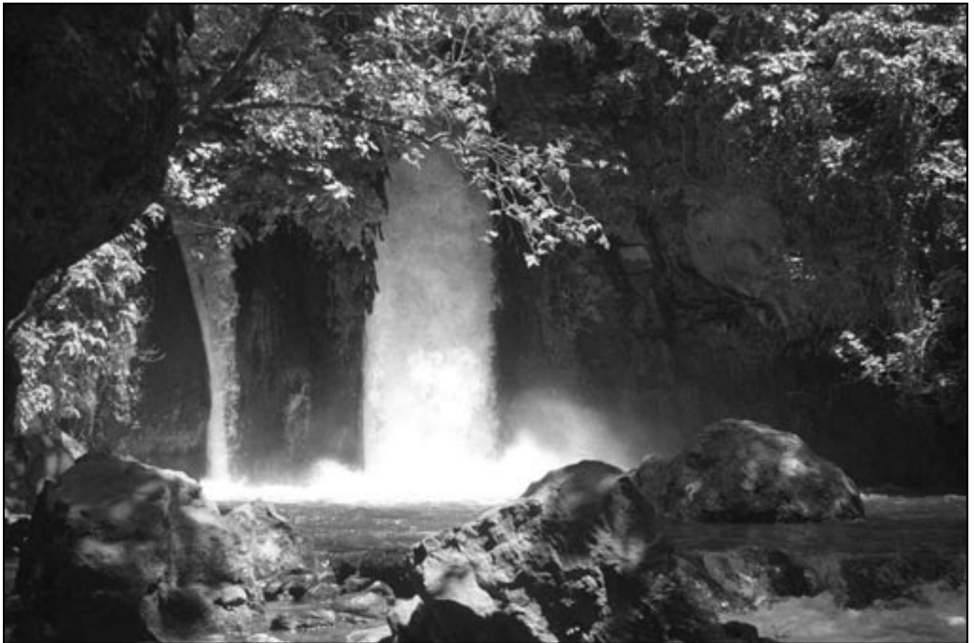
Winter in the Upper Galilee