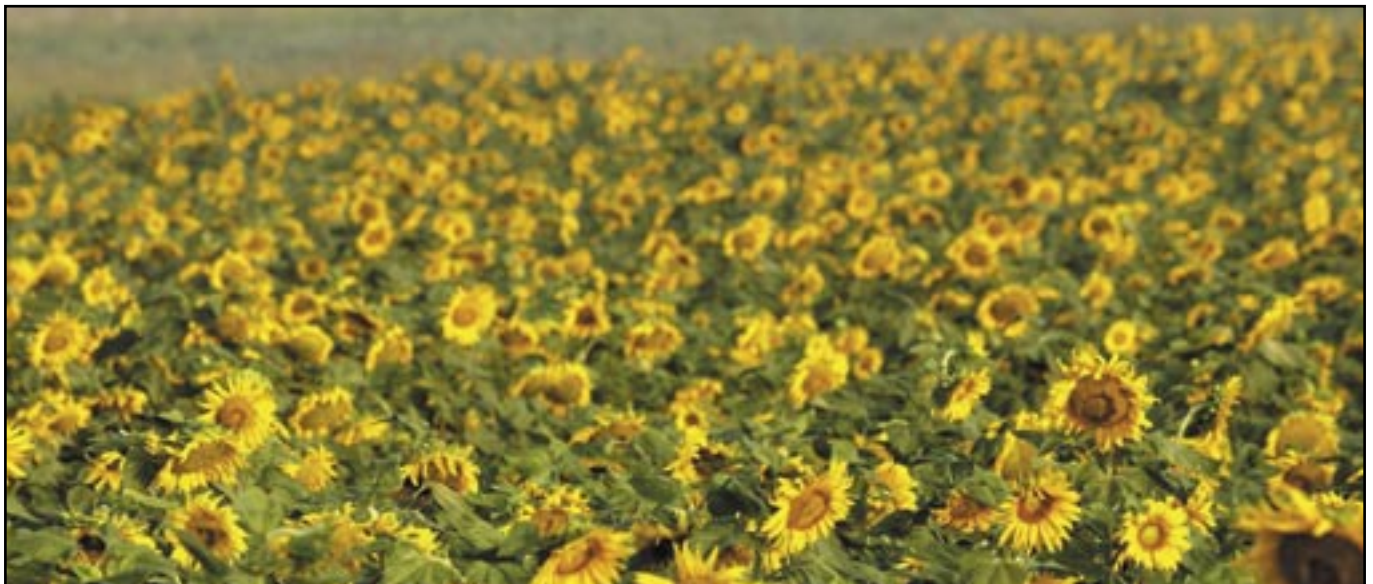
Spring in the Sharon plain